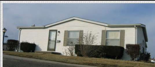
223 Pecan St $24,900 1988 Redman Doublewide

Monthly Home Site Fee—$236 Financing Available