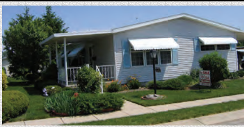
233 Heather Lane $73,500

Double wide-3 bedroom/ 2 bath, Central A/C, refrigerator, dishwasher, stove, washer and dryer, window treatments, 1 car garage, all weather room. 1992 Palm Harbor! WOW!!!