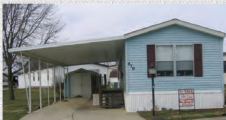
470 Oaklawn Dr $22,500 1993 Fleetwood

Cul-de-sac living at it's quietest! Friendly neighbors looking out for each other. Easy to take care of and affordable.