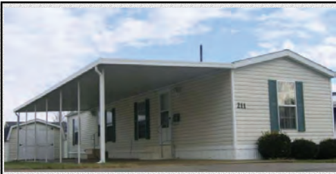
211 Pecan $21,900 1999 MHE Mansion Mfd Home

Hard to believe this house is ten years old..